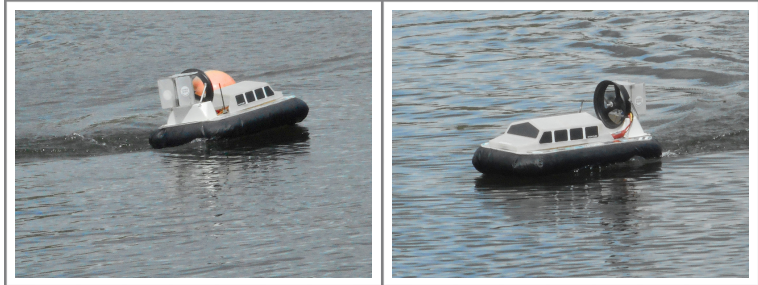
Something a little different from Chairman's Day