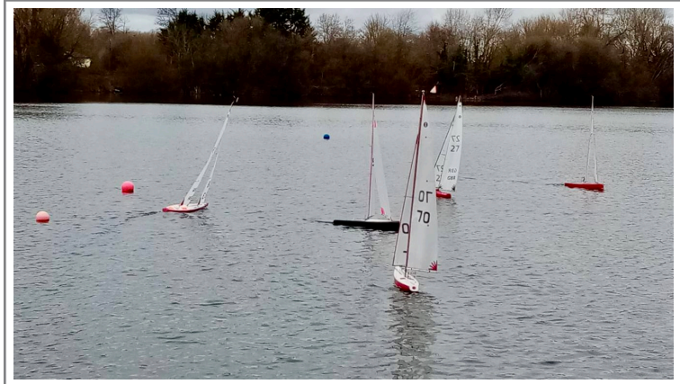
One Meters about to start a first round race in 2023