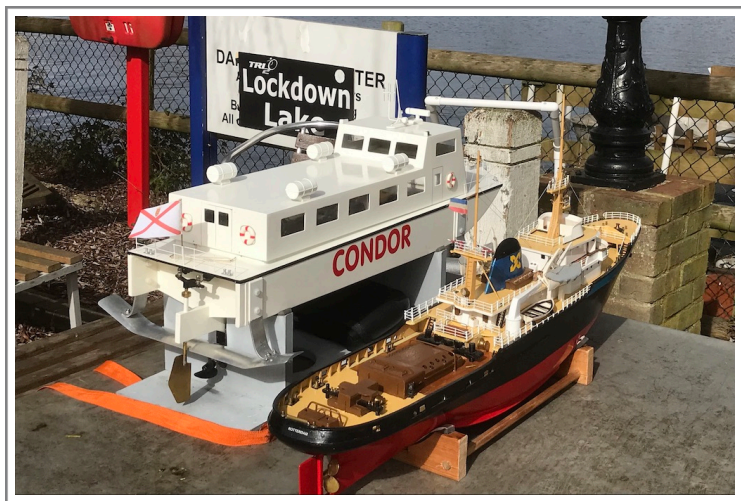
Condor hydrofoil and a restored model tug at the first Scale & Tug Towing meeting of the season on 11th March.