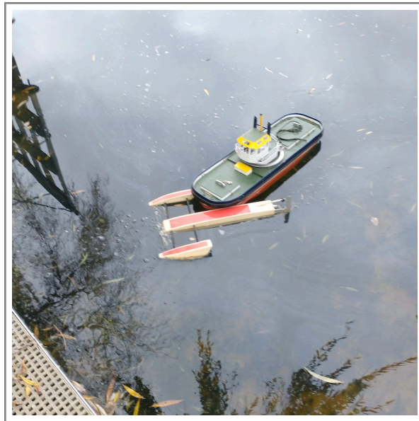
The versatility of a modern tug model demonstrated in this rescue.

Another link to utube which may be of interest to all modellers. https://youtu.be/lmLAmfM_AgA baking soda and superglue.