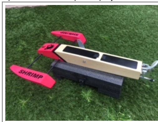
See you Lakeside

Below is a picture of the completed project.